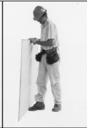
Lift sheet slightly and put toe under mid-point.