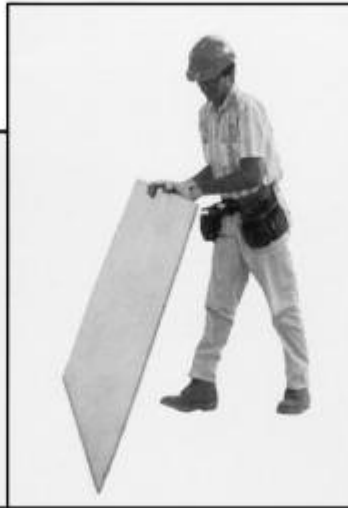
Tip sheet up to horizontal position.