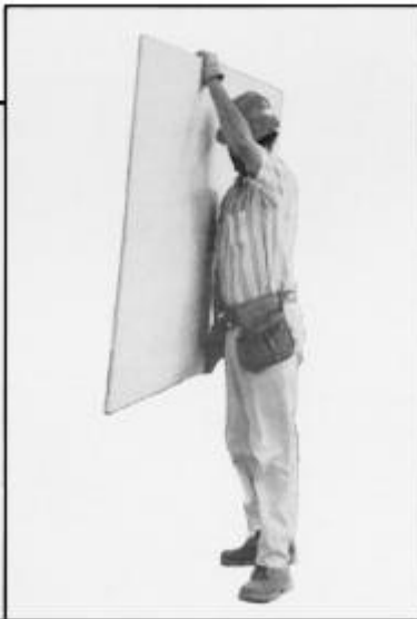
Stand and lift, maintaining the normal curve in your lower back.

To carry sheet material a distance, use a carrying handle.