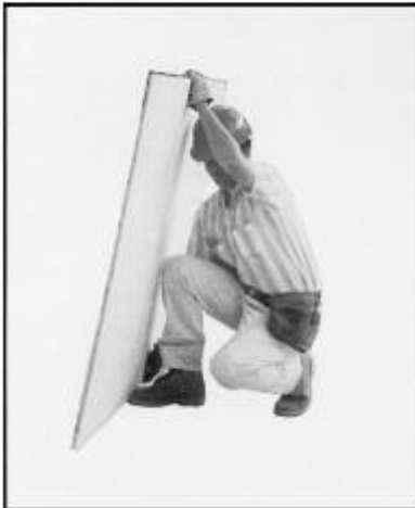
Bend at knees, keeping back upright. Slip free hand under sheet.