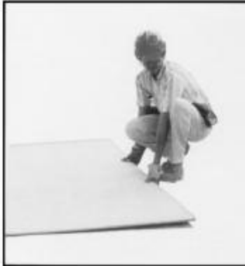
Bend knees, keeping back as upright as possible.

Demonstrate how to lift sheet material off the floor.